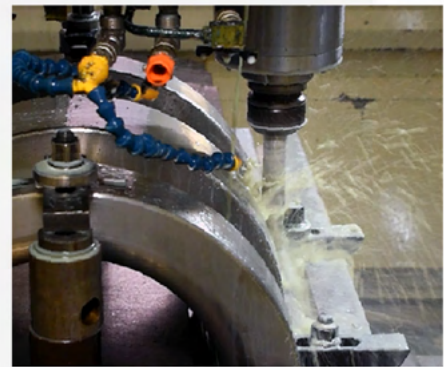
HARTFORD VERTICAL POWER CENTRE