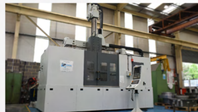
MORANDO VLN 12