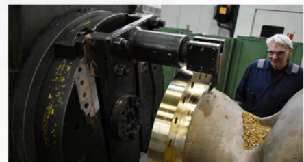
KEARNS RICHARDS SF125